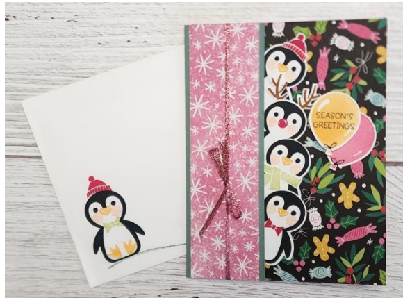
FRONT AND ENVELOPE