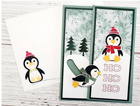
FRONT AND ENVELOPE

https://stampwithjeanne.com | Ordering: https://jeanneciolti.stampinup.net